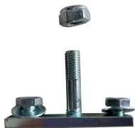
STEP7: get out the arm-bar link and take out the screw