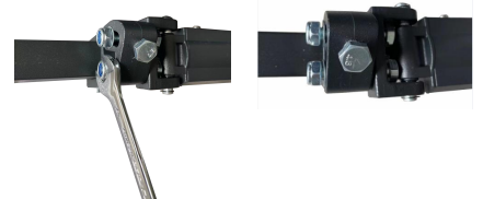
STEP6: use wrench to tight the screws and then is ok