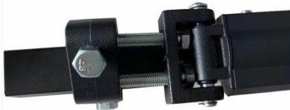
STEP4: connect it with the bracket which is on the square tube