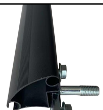
STEP9: put the arm-bar link into the front tube