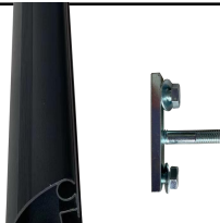
STEP8: connect the arm-bar link to front tube