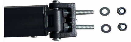
STEP3: take out the screws and spacers