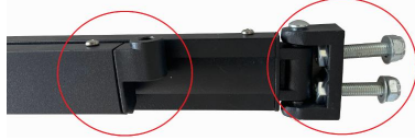
STEP2: one part connect with the bracket, one part connect with the front tube